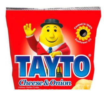
Example 4 in respect of crisps in Class 30 and amusement parks in Class 41.

The second test is only considered when all the material particulars are the same. The goods and services for which the mark seeks registration are taken into account at this stage. It is possible that a proposed series would be valid in respect of a particular class but not for other classes. The marks in Example 4 below would be a valid series for crisps in Class 30 but not for amusement parks (because the flavours would not be considered non-distinctive for Class 41).